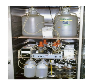
Figure 1 In vitro microbial caries model system.

Half of the surfaces were covered with acid resistant nail varnish (Figure 8). The demineralized specimens were randomly distributed into three groups, 21 in each with two containers.