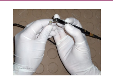
Figure 3 Measurement of a specimen using the ultrasound probe.

DIAGNOdent measurements were done at Hacettepe University Department of Restorative Dentistry (Ankara, Turkey). In the present study, the sixty four root surface