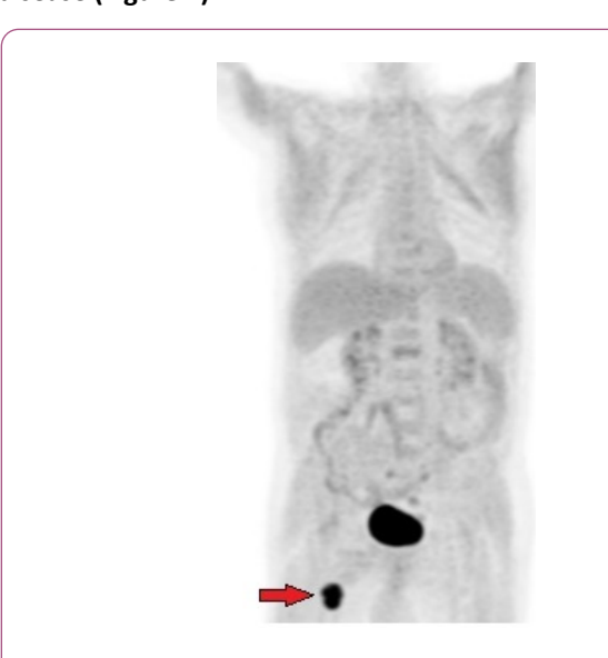
Figure 4 PET-CT reevaluation of the retroperitoneal mass but remaining right inguinal nodal uptake.

After that, he received chemotherapy (5<sup>th</sup> cycle), with good tolerance and ECOG 1. There were no signs of retroperitoneal disease (Figure 4).