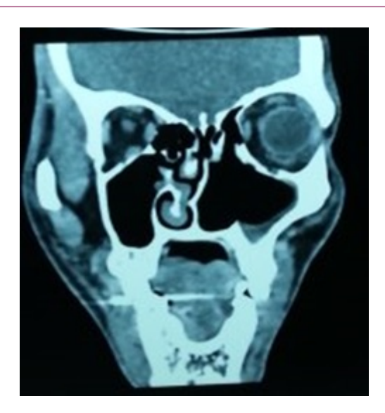
Figure 3 CT scan post-surgery showing complete tumor clearance.

plasmacytoma. Further hematologic examination was carried out which includes blood and urine for electrophoresis; Bence-Jones proteinuria to exclude multiple myeloma. Patient subsequently was treated with 25 cycle of radiotherapy. One month post radiotherapy, his nasal endoscopy examination revealed a small mass located medially to the left inferior turbinate who which he was planned for endoscopic left medial maxillectomy for tumor clearance. Histopathology examination from the inferior turbinate mass revealed inflamed nasal polyps with amyloid deposits. Till day, patient remained under multiple discipline follow-up and has not showed any evidence of systemic manifestations.