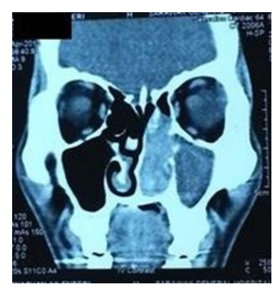
Figure 1 CT scan axial view showing homogenous mass filling up the left nasal cavity and maxillary sinus.

choanae, obliterating the left osteomethal complex (Figures 1-3).